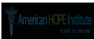
American Hope Institute