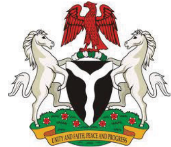
Federal Ministry of Justice