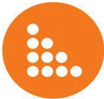
Digital Marketing Institute