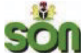
Standard Organization of Nigeria