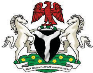
Office of the Special Adviser to the President on Ethics and Values